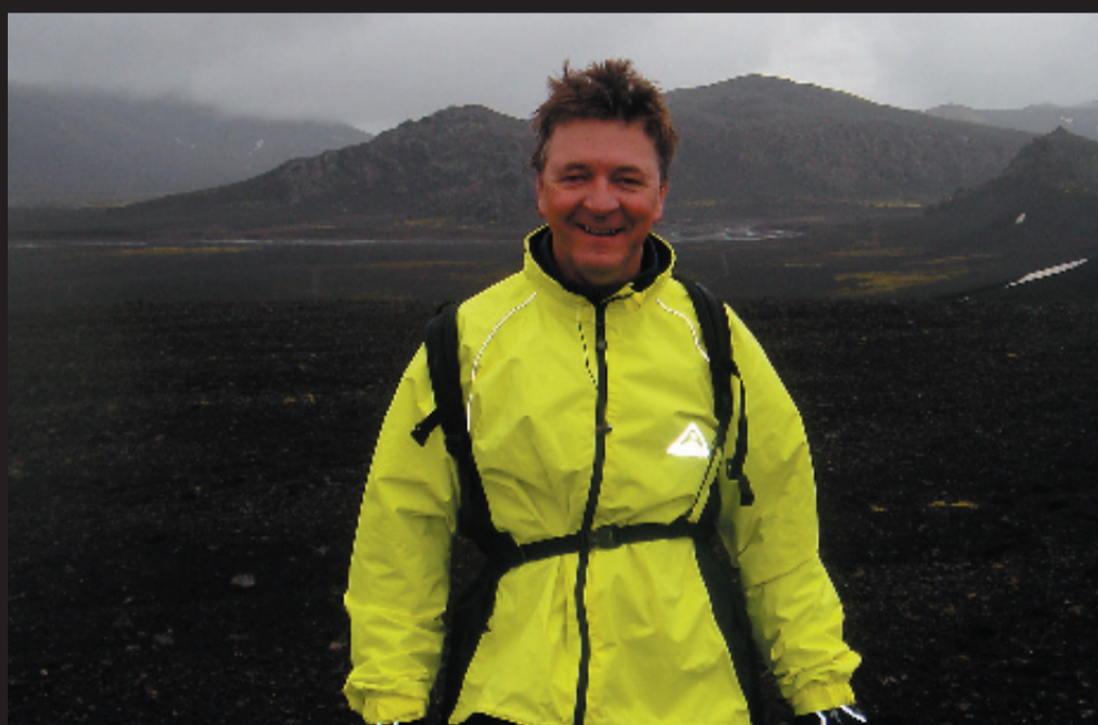
A stormy day, but great views of the third largest glacier in the world.

To sponsor Allison go to www.justgiving.com/mikeallison